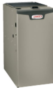
EL195 Gas Furnace