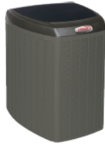
XC17 Air Conditioner