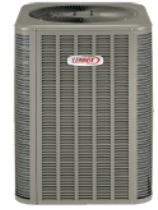
14ACX Air Conditioner