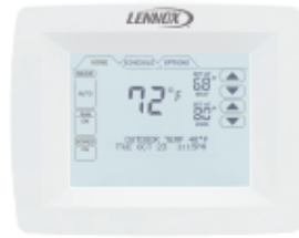
ComfortSense® 7000 Series Touchscreen Thermostat