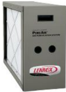
PureAir® Air Purification System