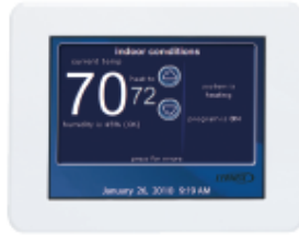
icomfort Touch™ Touchscreen Thermostat