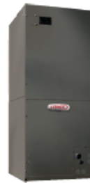
CBX32MV Variable Speed, Multi-position Air Handler