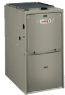
ML193 Gas Furnace