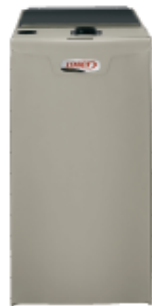
SLP98V Variable-Capacity Gas Furnace