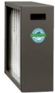
Healthy Climate 10 Media Air Cleaner