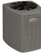
XC16 Air Conditioner