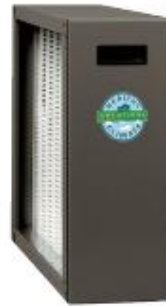
Healthy Climate 16 Media Air Cleaner