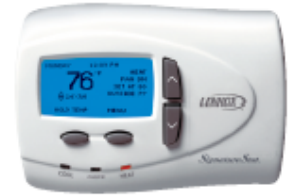
SignatureStat™ Home Comfort Control